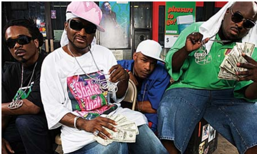
These are their heroes.

Black women love to dance—in a way white people might call gyrating. They dance in the hall, in the classroom, on the chairs, next to the chairs, under the chairs, everywhere. Once I took a call on my cell phone and had to step